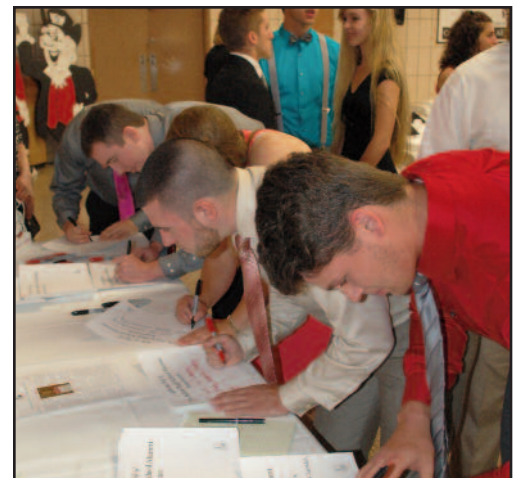
At the banquet, scholarship recipients wrote messages for SHSAA's Giving Tuesday initiative.